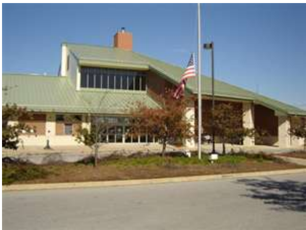
Public Library – Bear, Delaware, 101 Governor's Place, Bear DE 19701

After cultivating relationships with Delaware’s library community for more than three years, the Delaware Workforce Investment Board (DWIB); the Delaware Department of Labor (DOL); its Division of Employment and Training (DOLDET); and the Delaware Division of Libraries (DDL) are working together to push job seeker services through local libraries via the Broadband Technologies Opportunities Program (BTOP) $2.8 million grant.